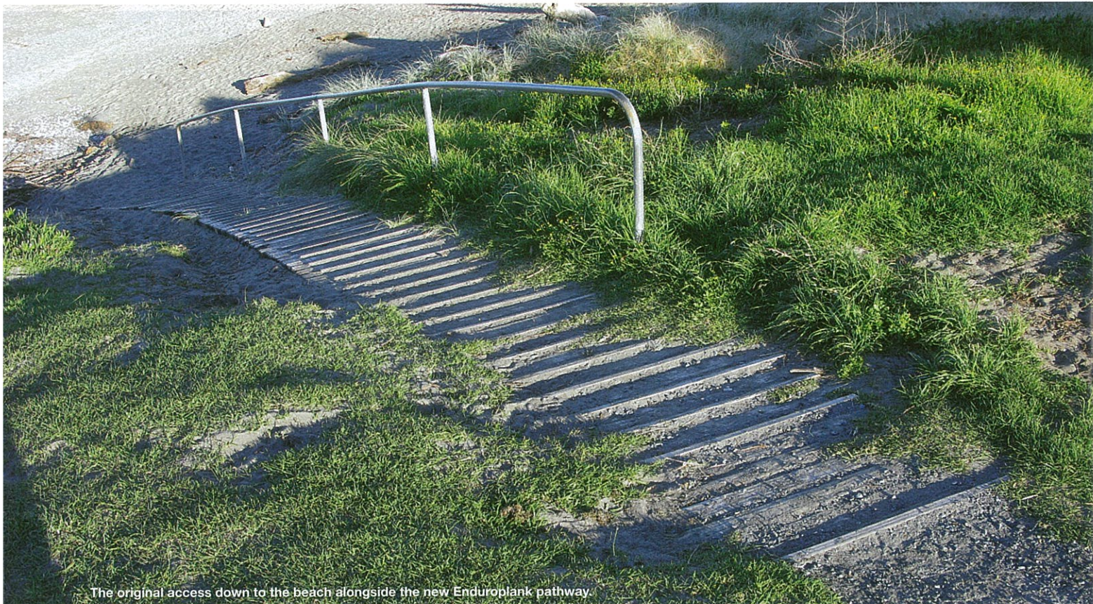
The original access down to the beach alongside the new Enduroplank pathway.

"We are really pleased to see New Zealand councils start to pick up the idea of using recycled plastic where they can," says Carl Longstaff, Metal Art's managing director. "After all, councils promote recycling and make a big public investment in managing it." Replas turns waste material into something functional and long-lasting, extending the use of a finite resource by decades; and when its day is eventually done, it can be recycled again. For KCDC, however it was more than just a matter of being seen to be green.