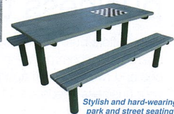
Stylish and hard-wearing park and street seating