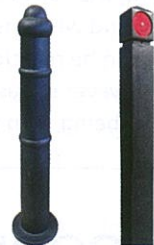
Bollards that never need painting from $37.00 plus GST